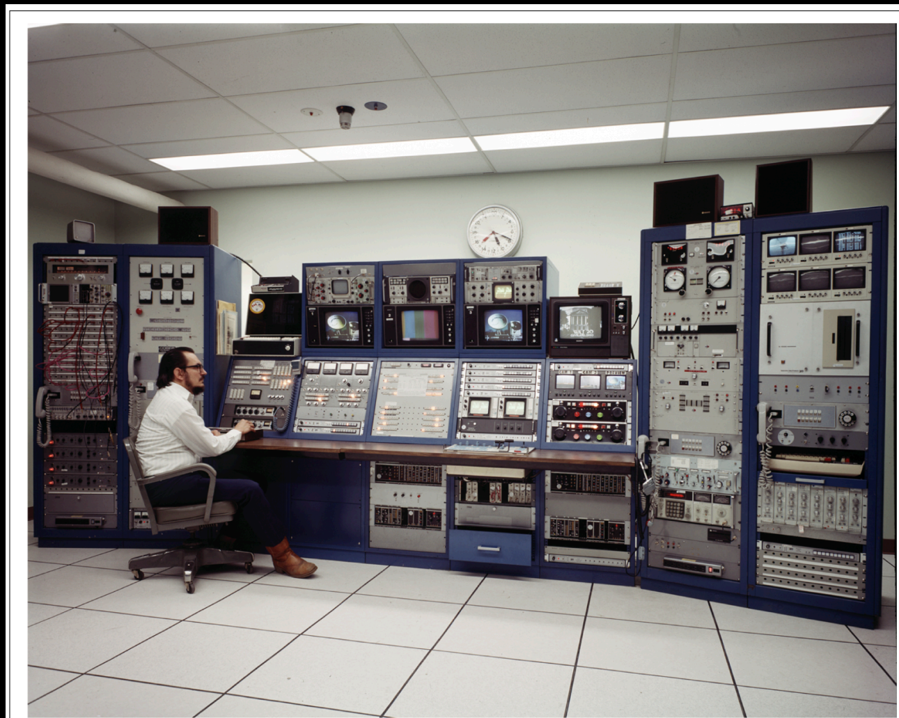
Figure 14-1. Control panel in the NASA spacecraft control center, illustrating possibly very complex configuration